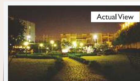
POWER BACK-UP FOR STREET LIGHTS