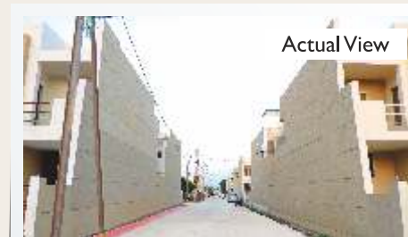
WIDE NETWORK OF INTERNAL ROADS