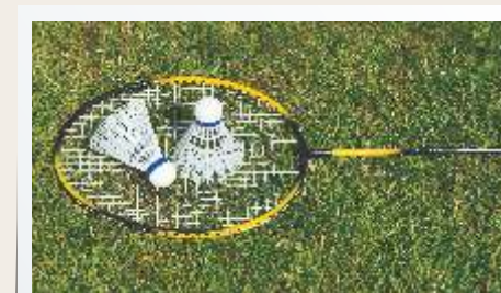
OPEN BADMINTON COURT