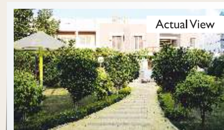
POLLUTION FREE CAMPUS